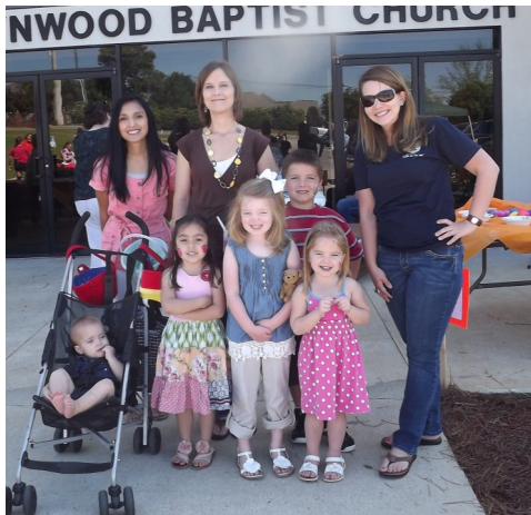
Zeta Tots Easter Egg Hunt Event